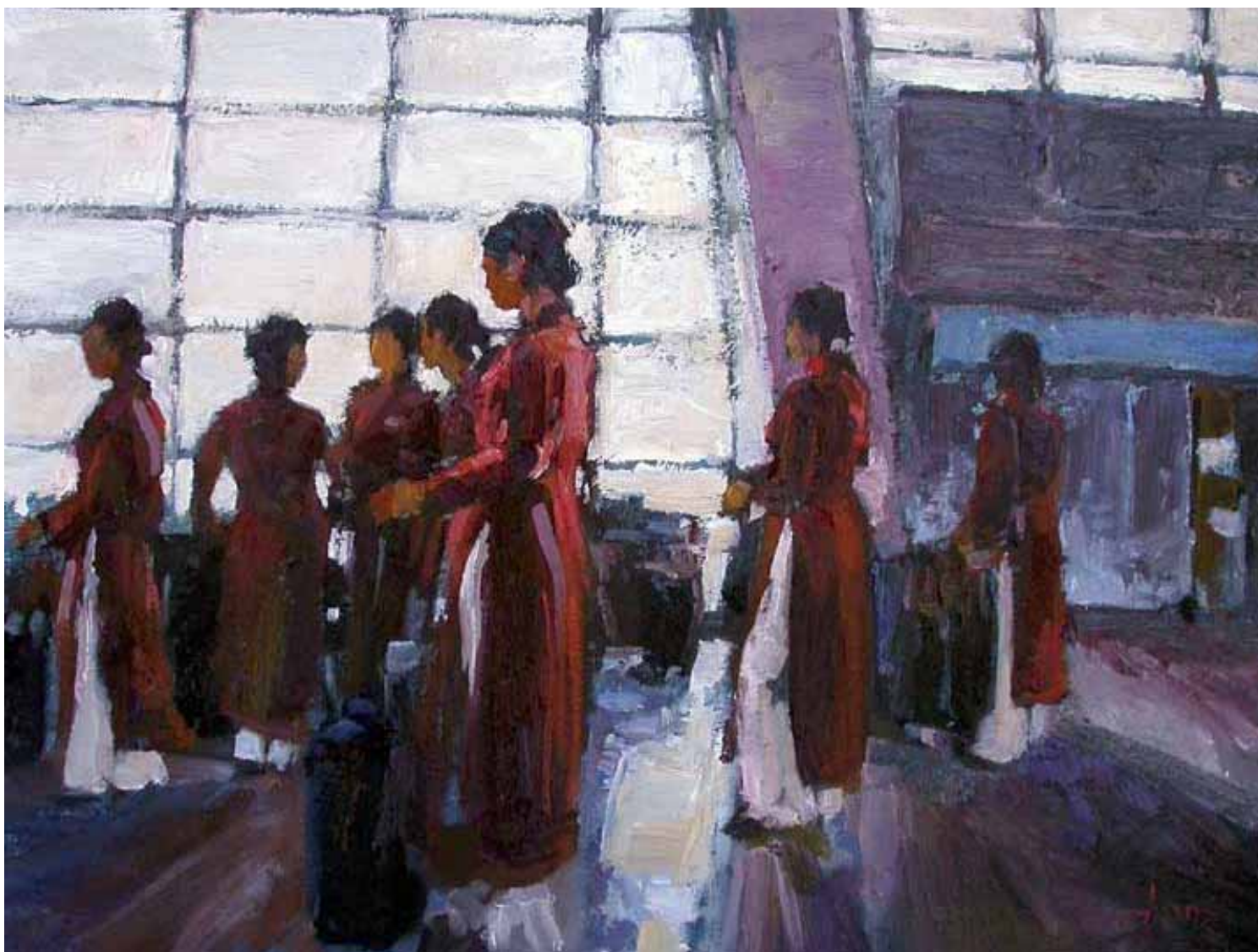
Viet Nam Air , Oil on Canvas, 14"x18." Click on image for larger view.

S tanding. It just may be how we spend a third of our lives—the other being lying and sitting. Who knows? Except that it likely varies widely between individuals. We can say that of all the animals, we're the standers. Homo erectus, they call us, "they" being all the rest of the animals, the ones that speak Latin.