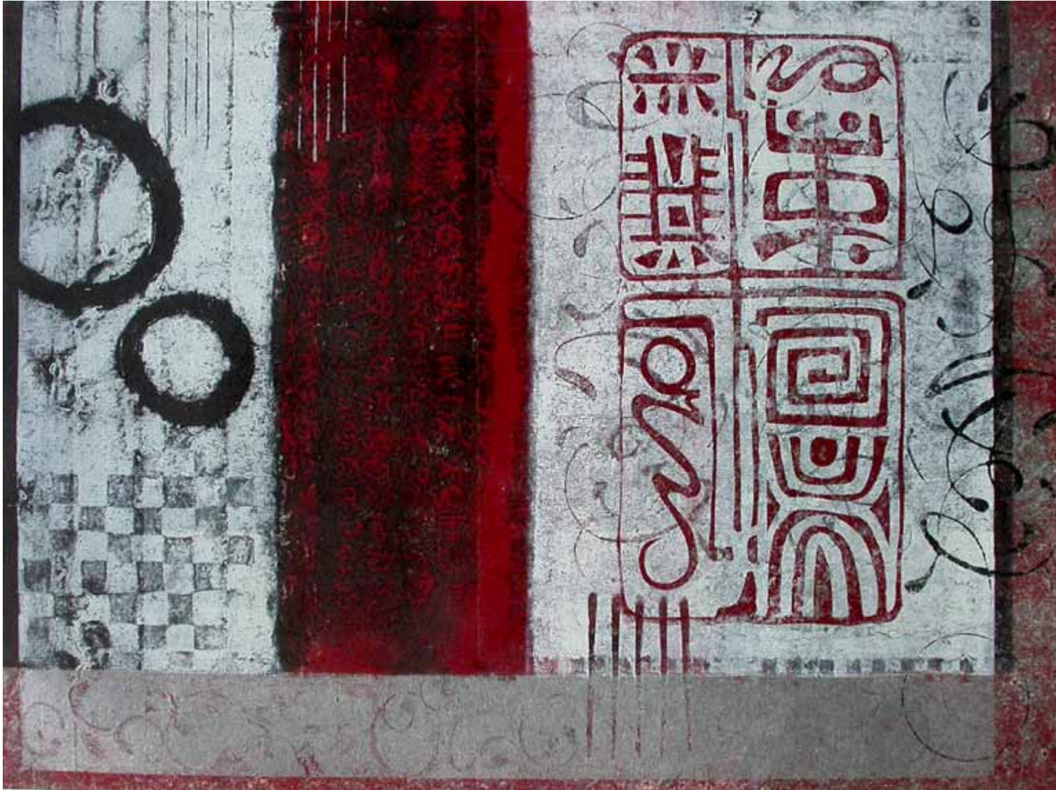
Mixed Metaphor, monotype, 16"x22"

While each is different, there's a theme. Mixed Metaphor is more dramatic in contrast than some and is produced from a more limited palette (if "palette" is the word, when it's really ink rolled out on a plate). Often the objects she uses to print from are of her own creation, carved "linocuts," sometimes left from earlier creations, sometime cut specifically for the new purpose. As often as not, it's a process of discovery as well as planning.