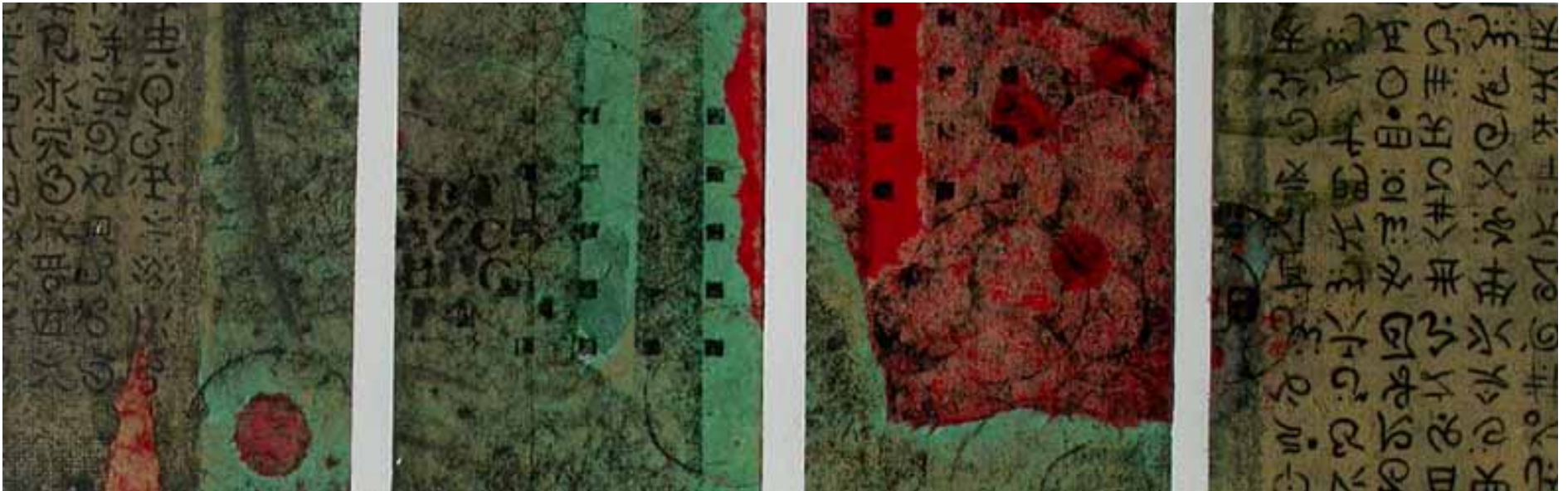
Parallel Passages, monotype, 7"x21.5"

Did I say it was a process of “discovery?” This one was originally created as one large square but it didn’t look right so Anne cut into quarters. That’s always a big risk, but in this process everything is. When she placed the pieces side by side it made a new sense, so there it is. Note the “writing systems,” another of Anne’s themes. These are made up, symbols of symbols as it were, influenced by Chinese and Arabic letter forms. She carves these by hand on linoleum. The textures are from torn papers, themselves like as not found in out-of-the-way places. These monotypes are studies in pattern, color, and even somewhat three-dimensional when you get up close. As with all of these, you can click on the picture for a larger view.