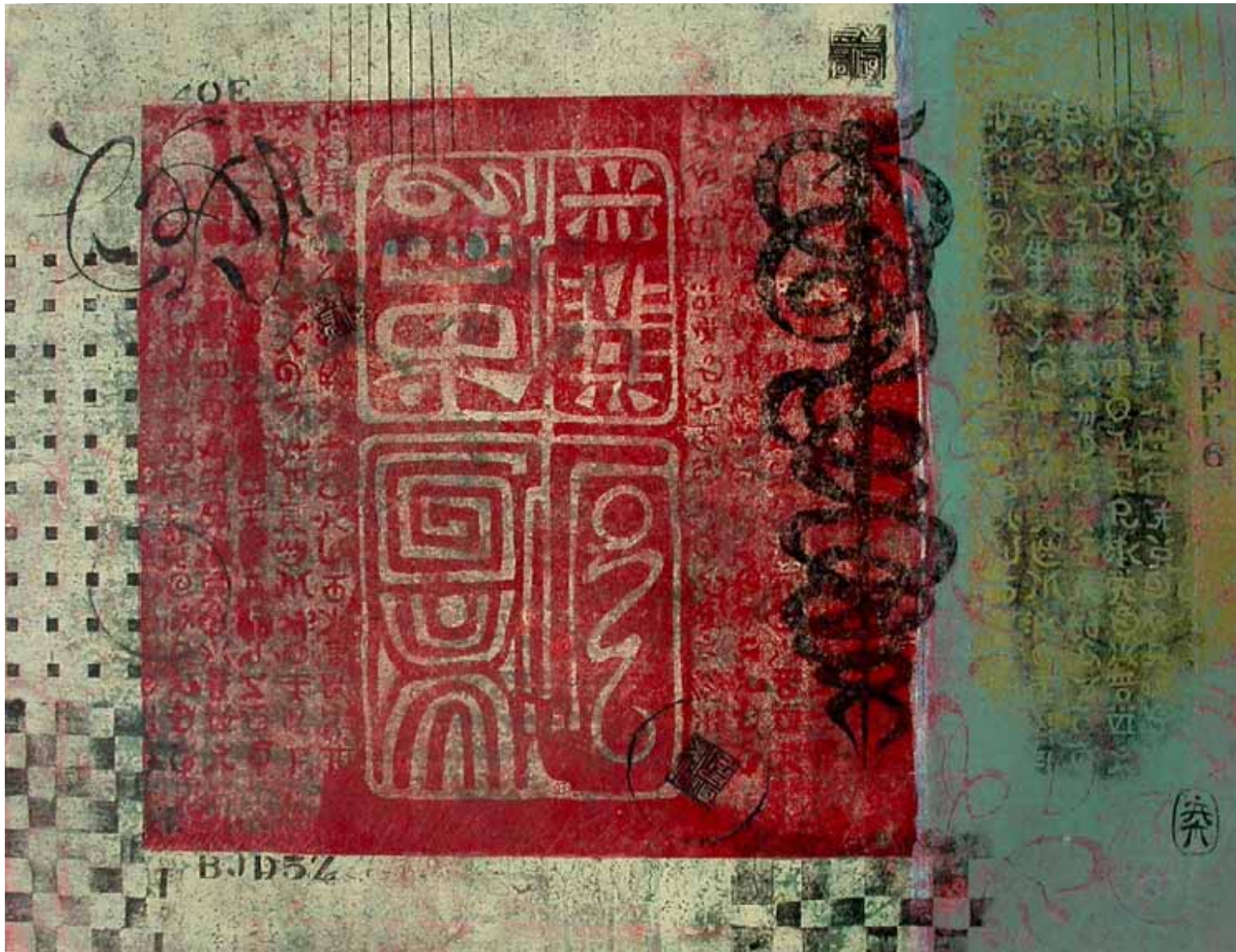
Matter of Opinion, monotype, 18"x24"