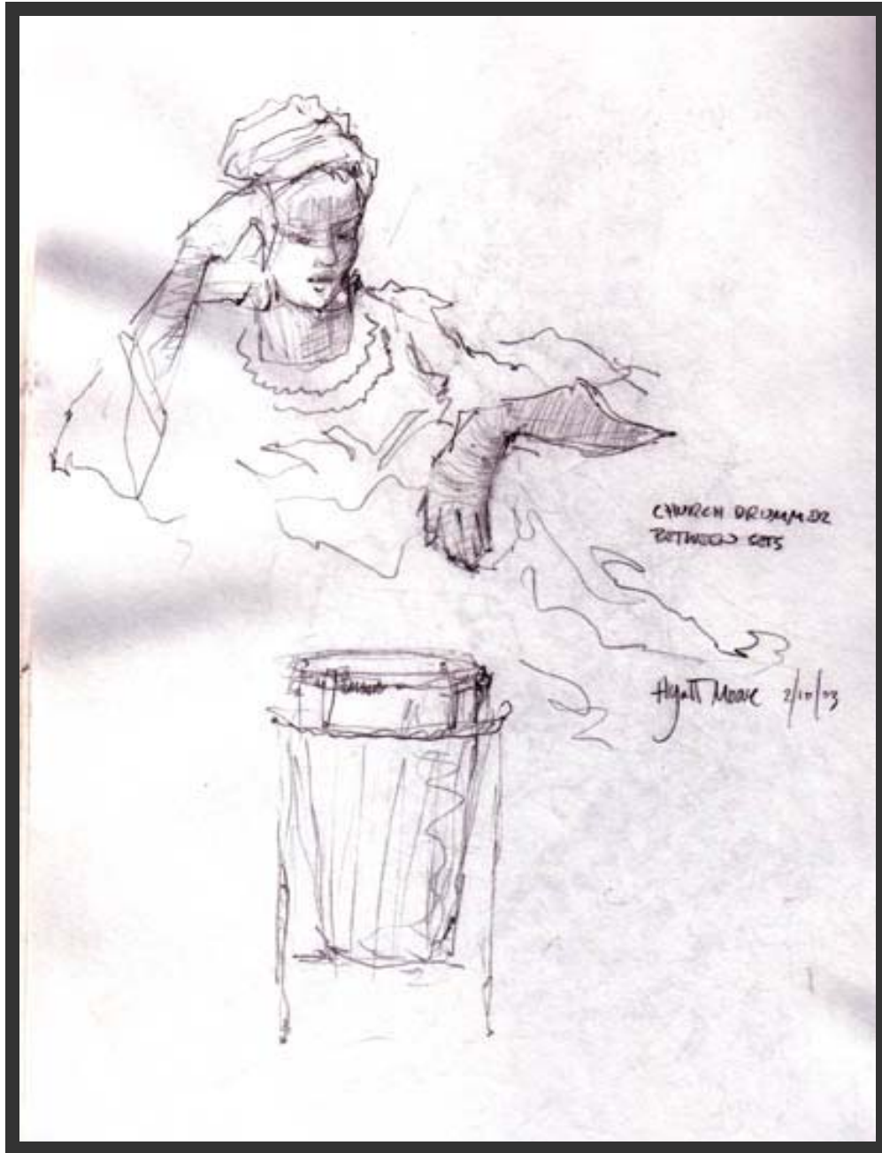
Church Drummer Between Sets, Women's Choir. The only accompaniment was hand drums and rhythm instruments. That, and voice, were all that's needed for lifting spirits high.