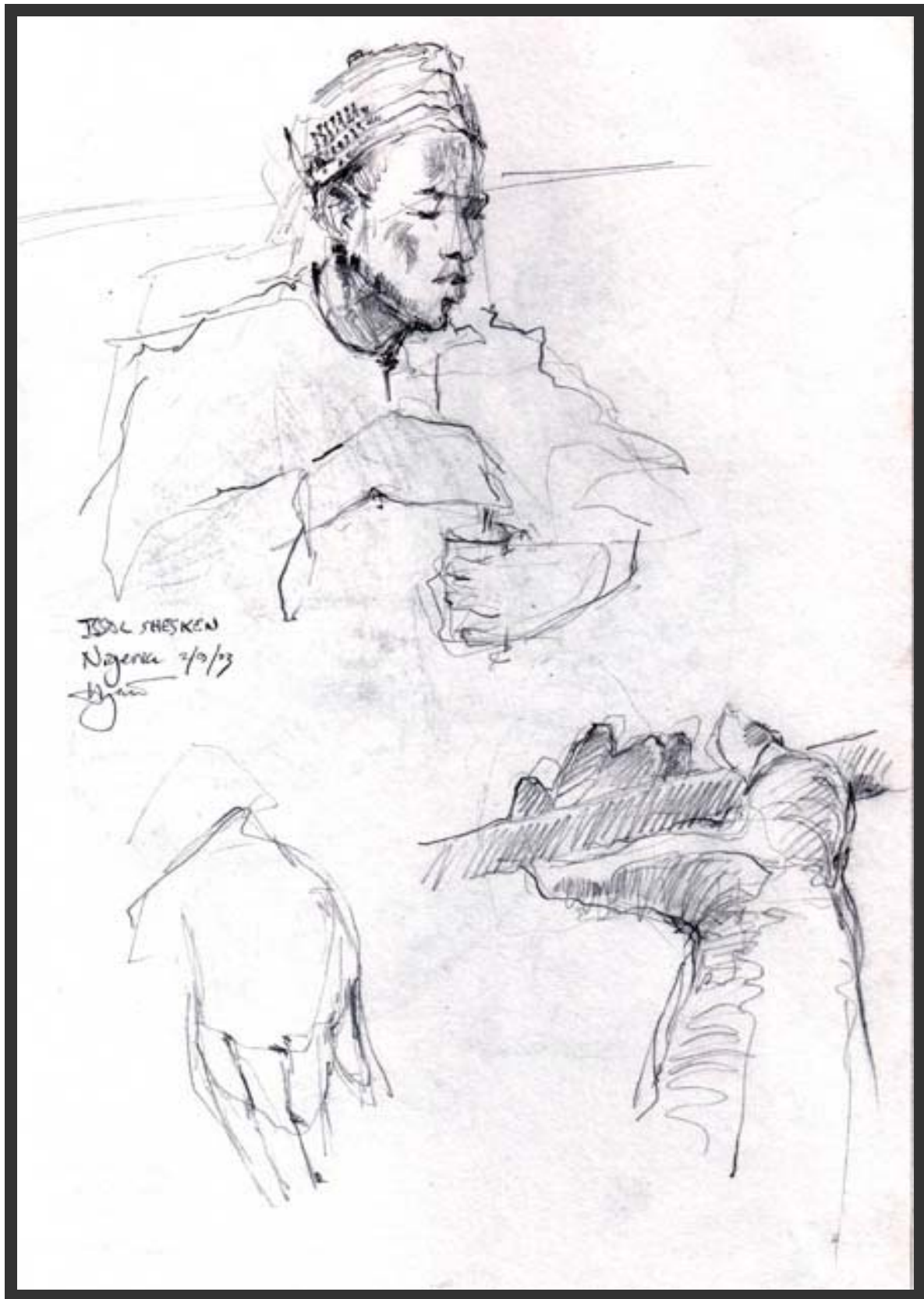
Isaac Shesken stirring coffee, and hand studies.