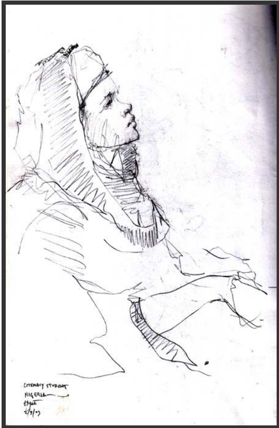
Same girl as above, unconscious of her own serene beauty, intent on learning