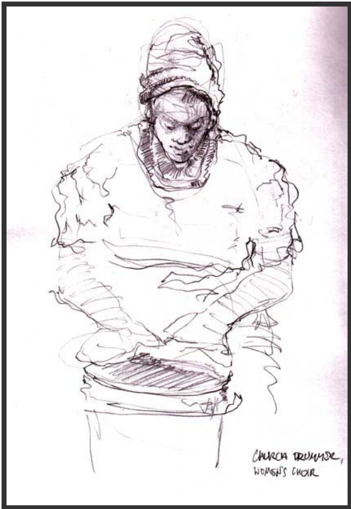
Church Drummer, one in a row of several, great music, hands all a blur . . .