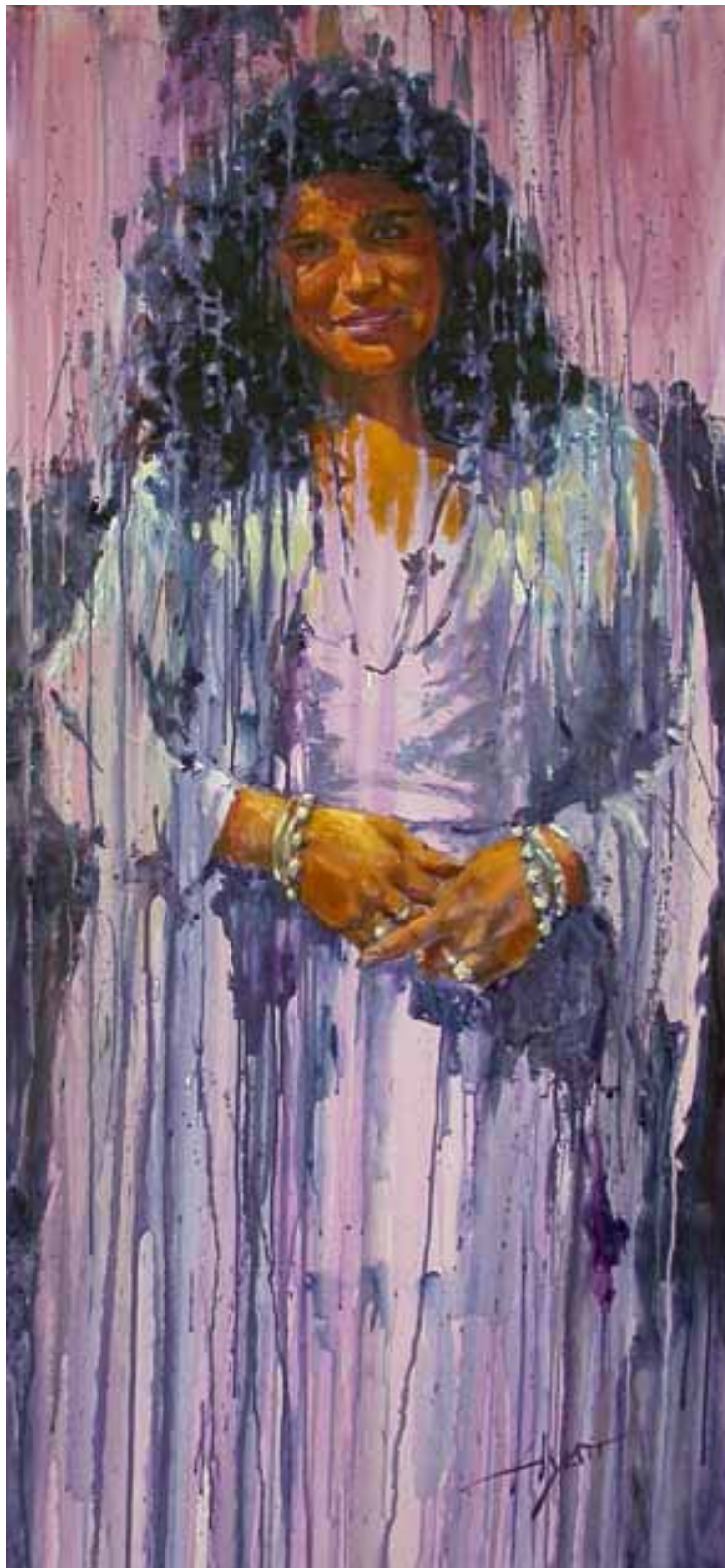
Talar, 60"x27," Oil over Acrylic on Canvas