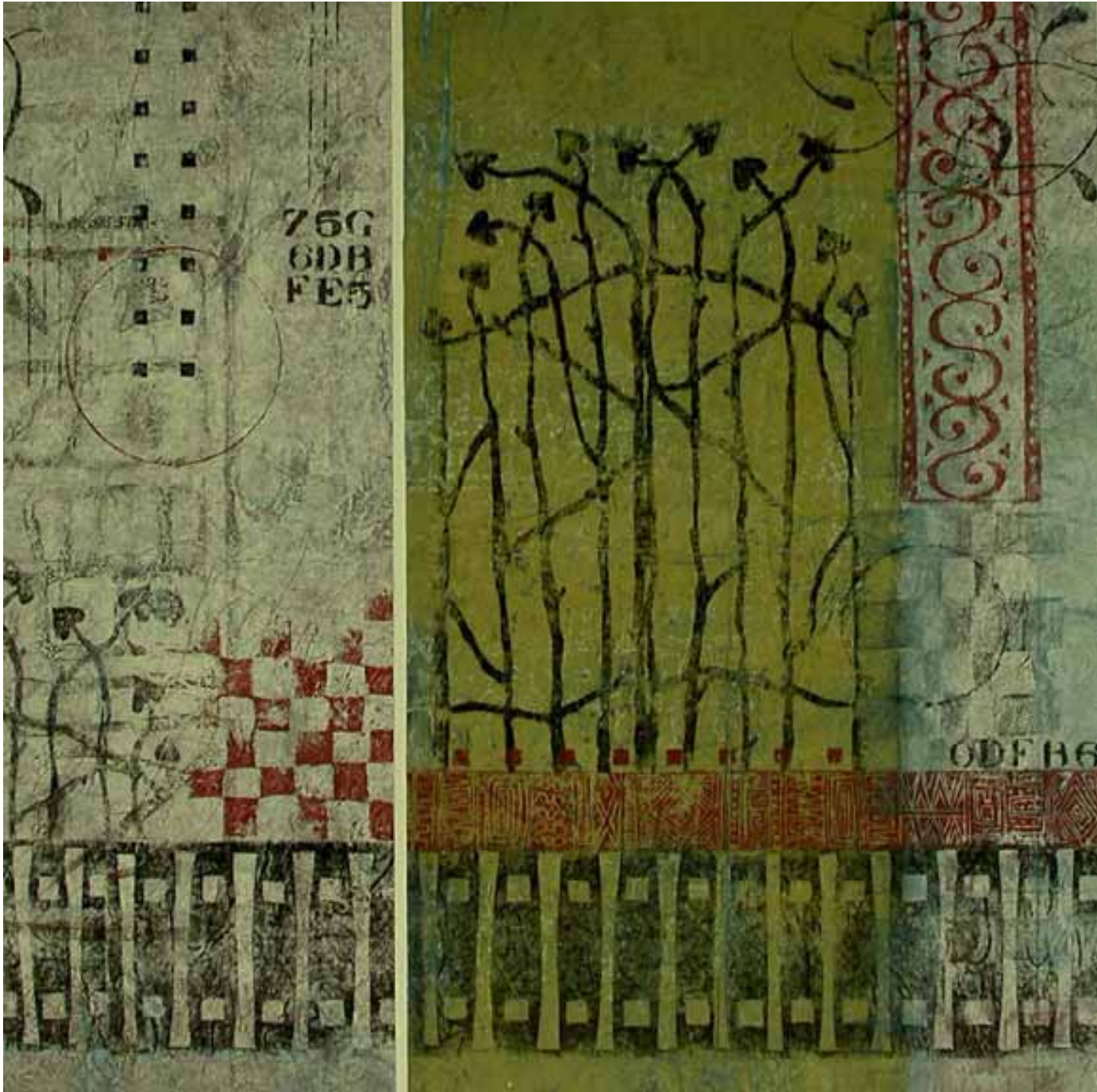
Sense of Direction, 18"x18," Monotype Print on Paper