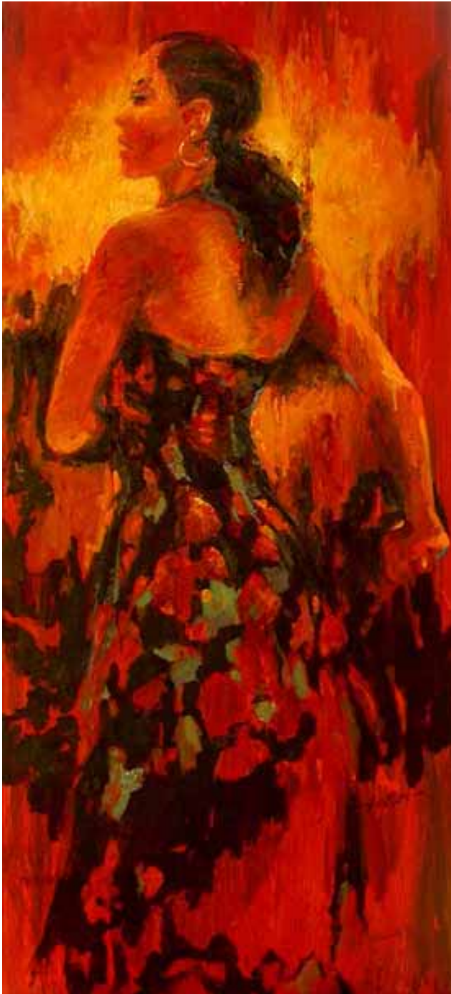
Flamenco Fire, 60"x27," Oil on Canvas