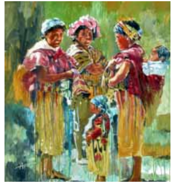
Quiche Mothers, 72"x64," Oil over Acrylic on Canvas

Now their home is graced with 11 new Hyatt Moore paintings. The area takes on museum-like qualities, particularly with the multi-ethnic images at home in all the air and light and space. A few of the larger pieces are shown here in their new environments. Click on the painting itself for a link to the website and and then again for a larger view .