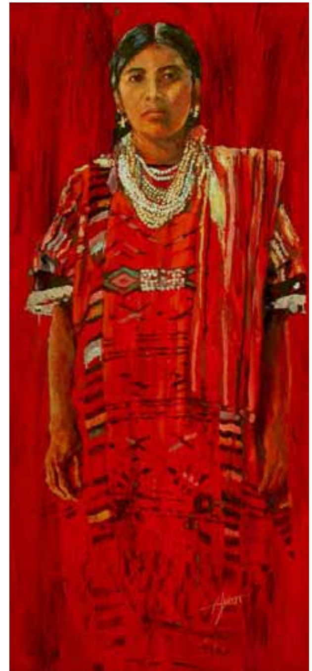
Chinentec on Red, 60"x27," Oil on Canvas (Left) Wedding Dancer, 60"x45," Oil on Canvas

These quick digital pictures shot on the day of the hanging don't really do justice to the space. And "Wedding Dancer" will be getting a frame in time. But they give an idea of how paintings further enhance an already beautiful space. The juxtaposition of the "people of the earth" in the gracious, modern setting shows a welcomeness for all and an equality of worth under God.