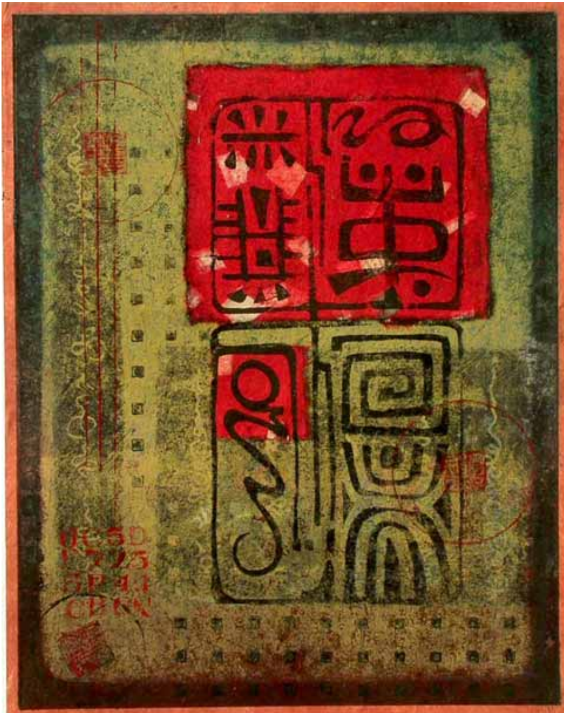
Forging Ahead, 17"x13." Click on images for larger view.

Here are two more, among many. Check the web-site, and click for enlarged view. In person, up close, is best.