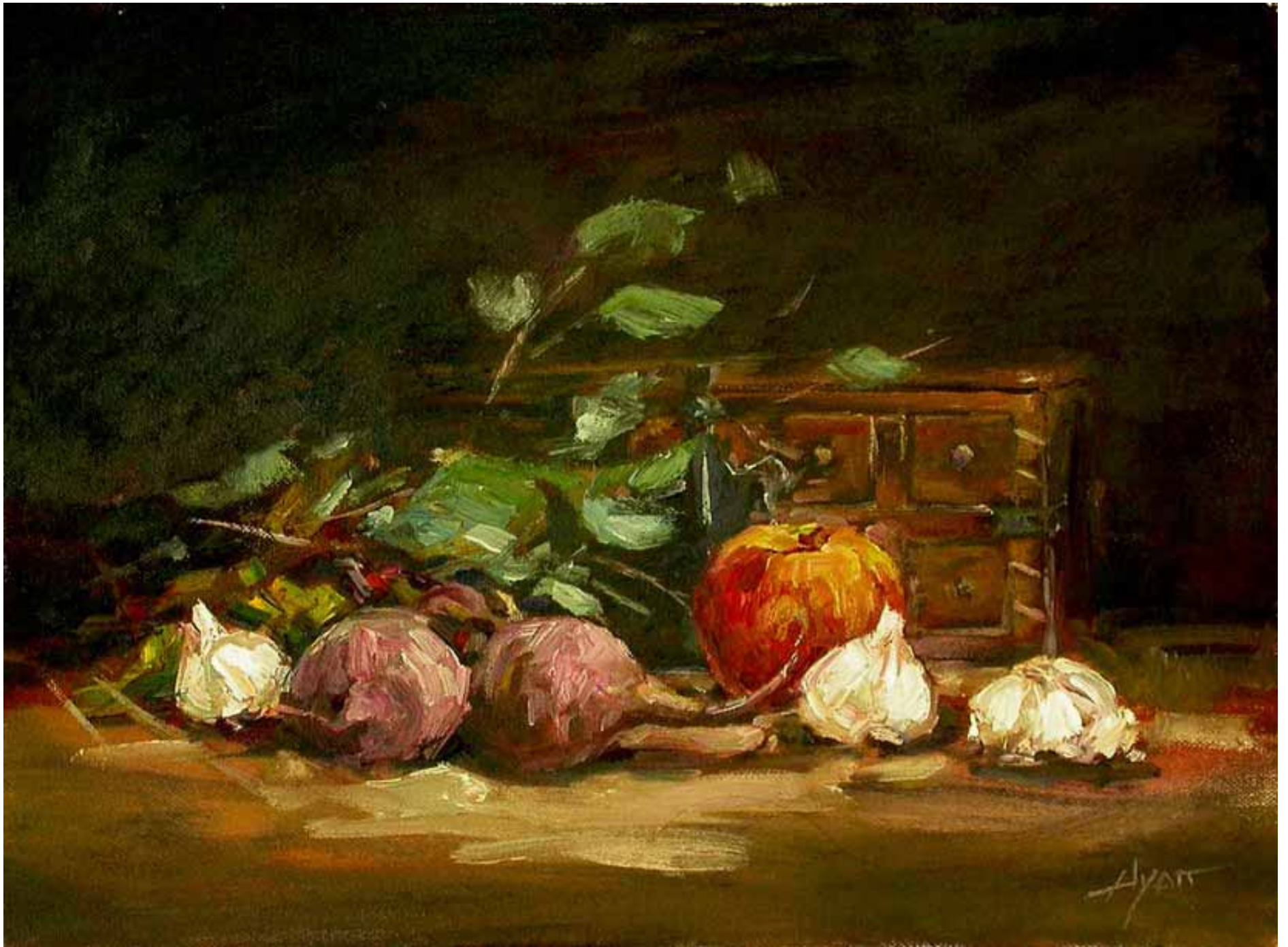
Wood Box, 12"x16," Oil on canvas.