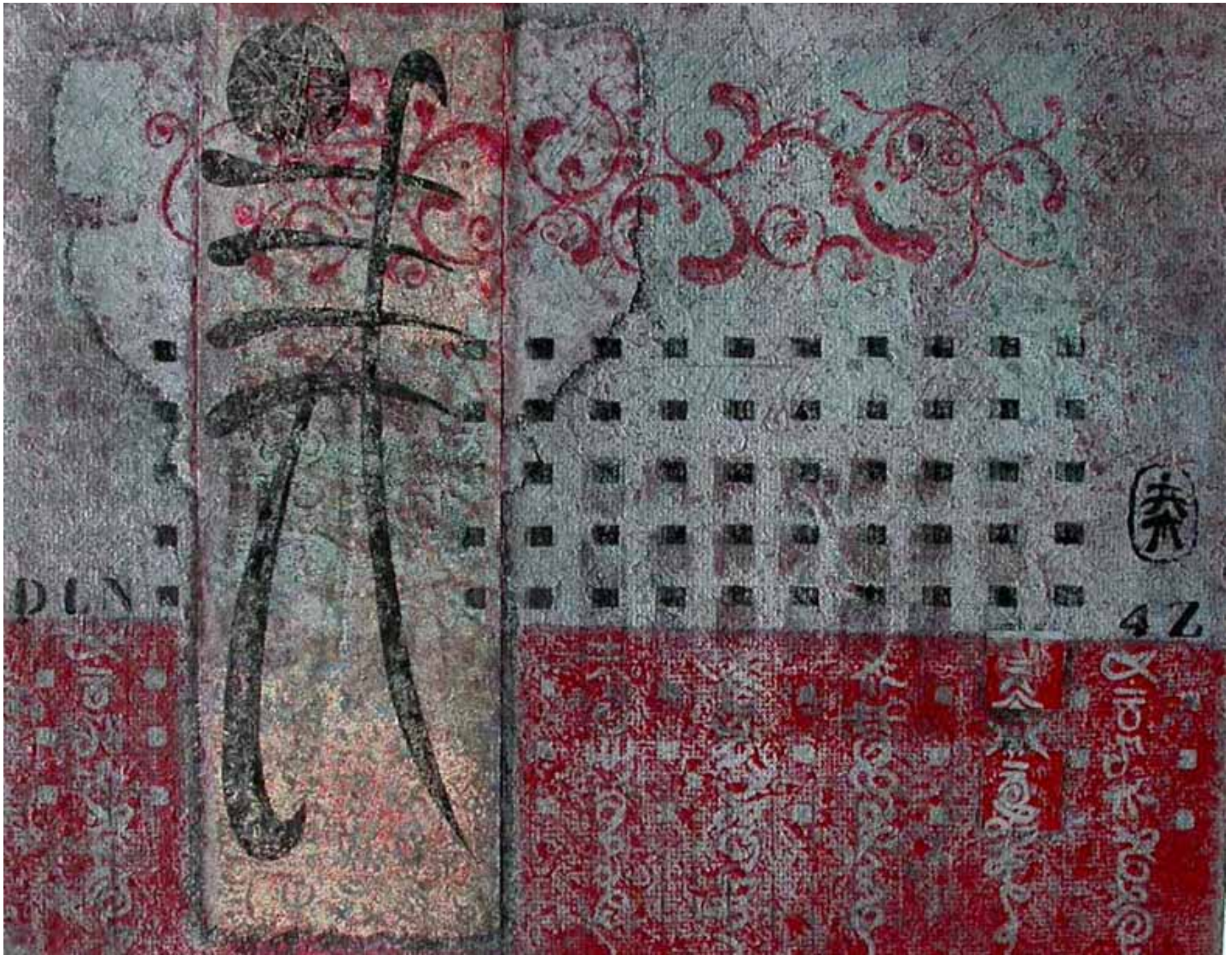
Maintaining Perspective, 12"x16."