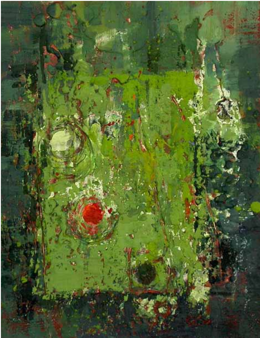
Golf, 18"x14," Encaustic on board.