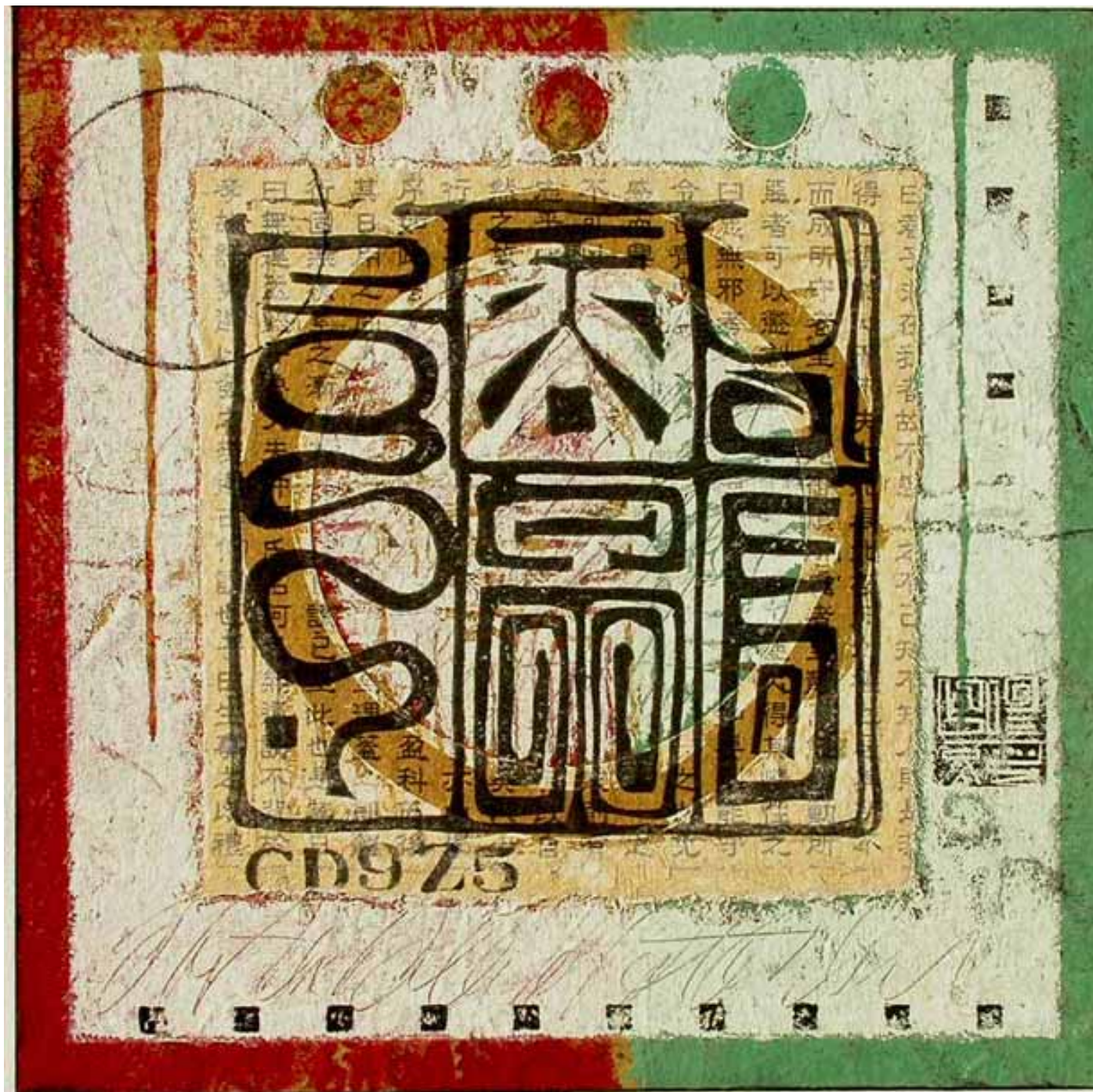
Recorded Transaction, Monotype, 10"x10." Click on image for larger view.