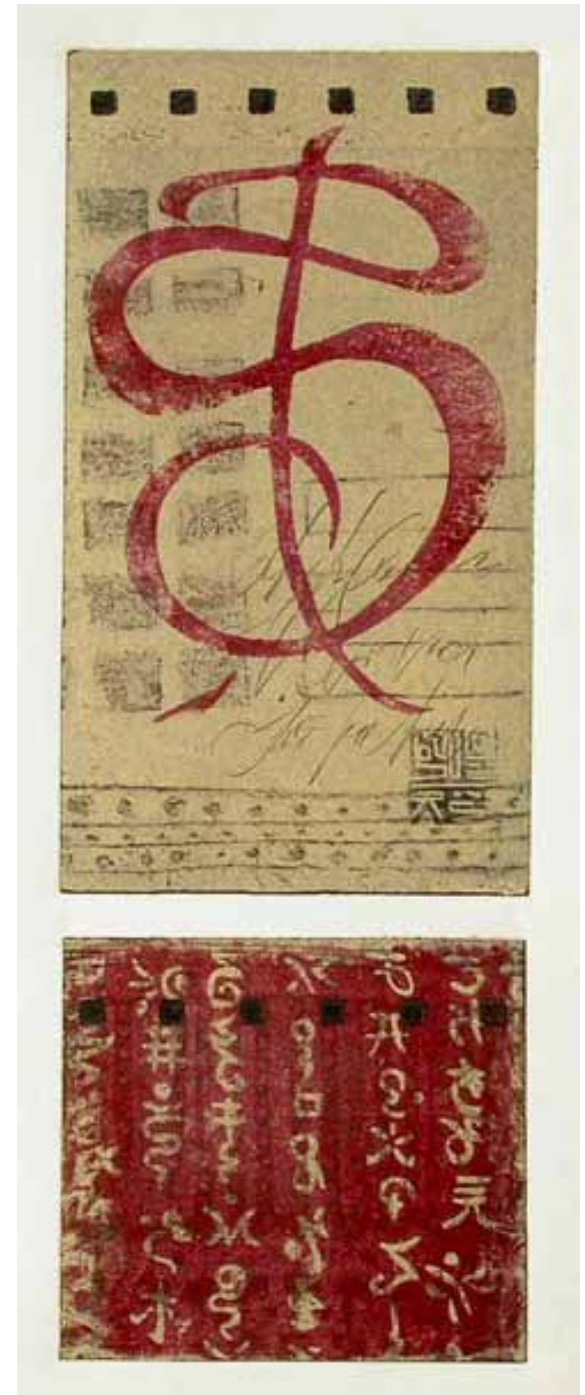
Orchestral Offering, 14"x5."

Here are two more, among many. Check the web-site, and click for enlarged view. In person, up close, is best.