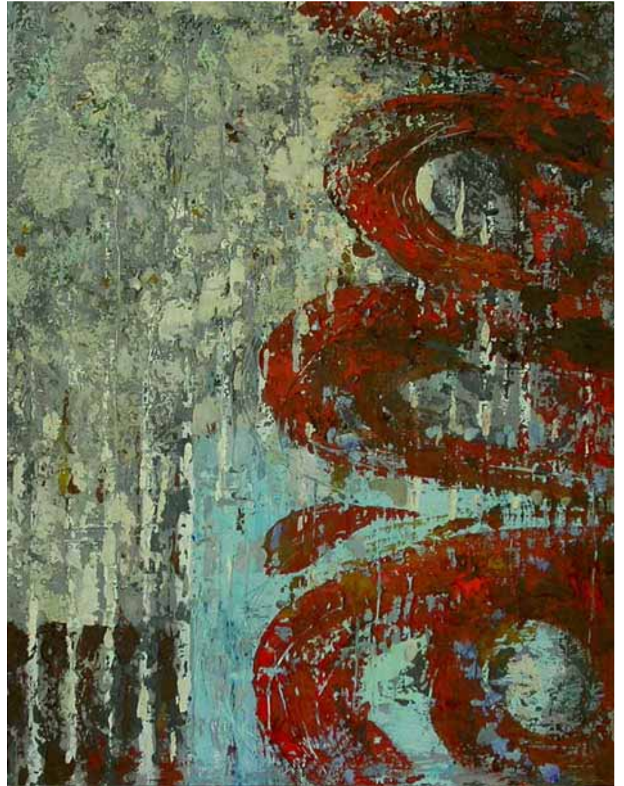
Silent Signal, 18"x14," Encaustic on board.

The designs don't have to be abstract, though to date most of mine have been. People ask if they'll melt but it's not a problem. Well, maybe in direct sun . . . but then art never survives in direct sun. Of course, we'll never know about the pieces that didn't make it through at Pompeii.