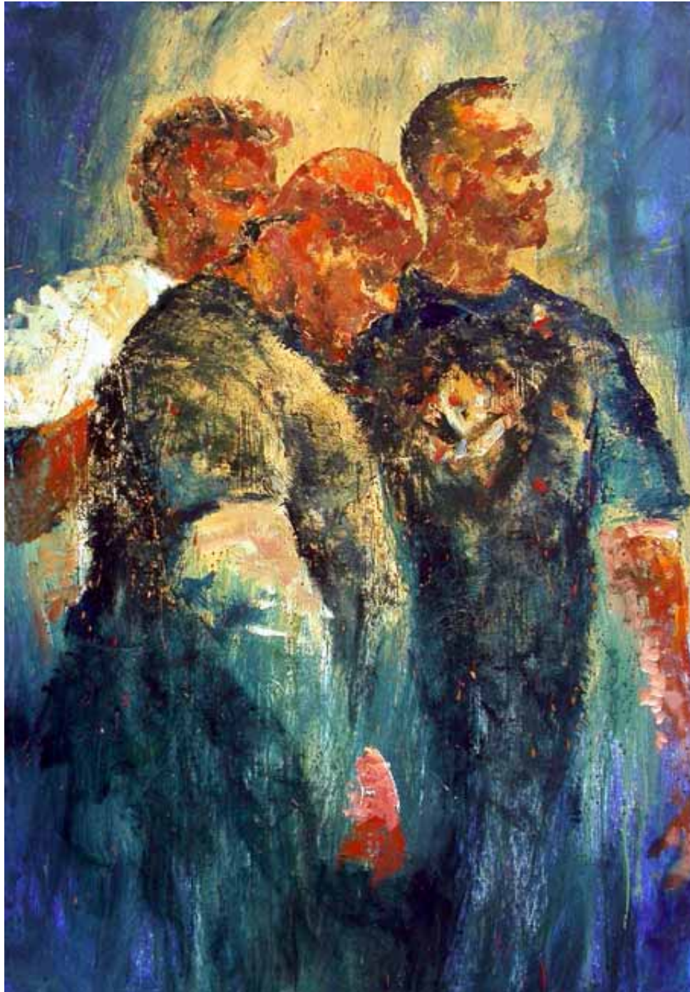
Band of Brothers, Acrylic on canvas, 72x48.