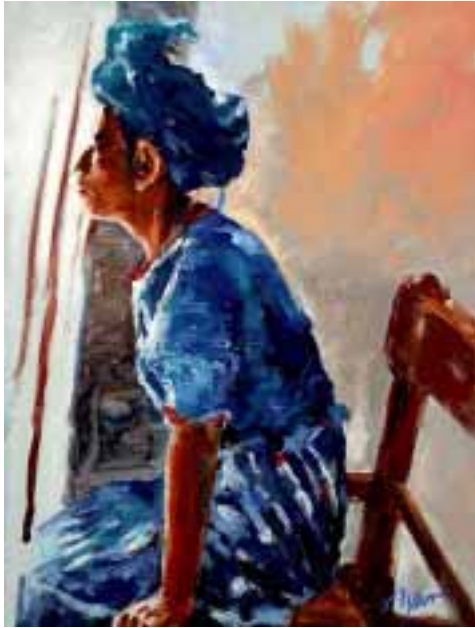
Sandra Profile , Oil, 16"x12."