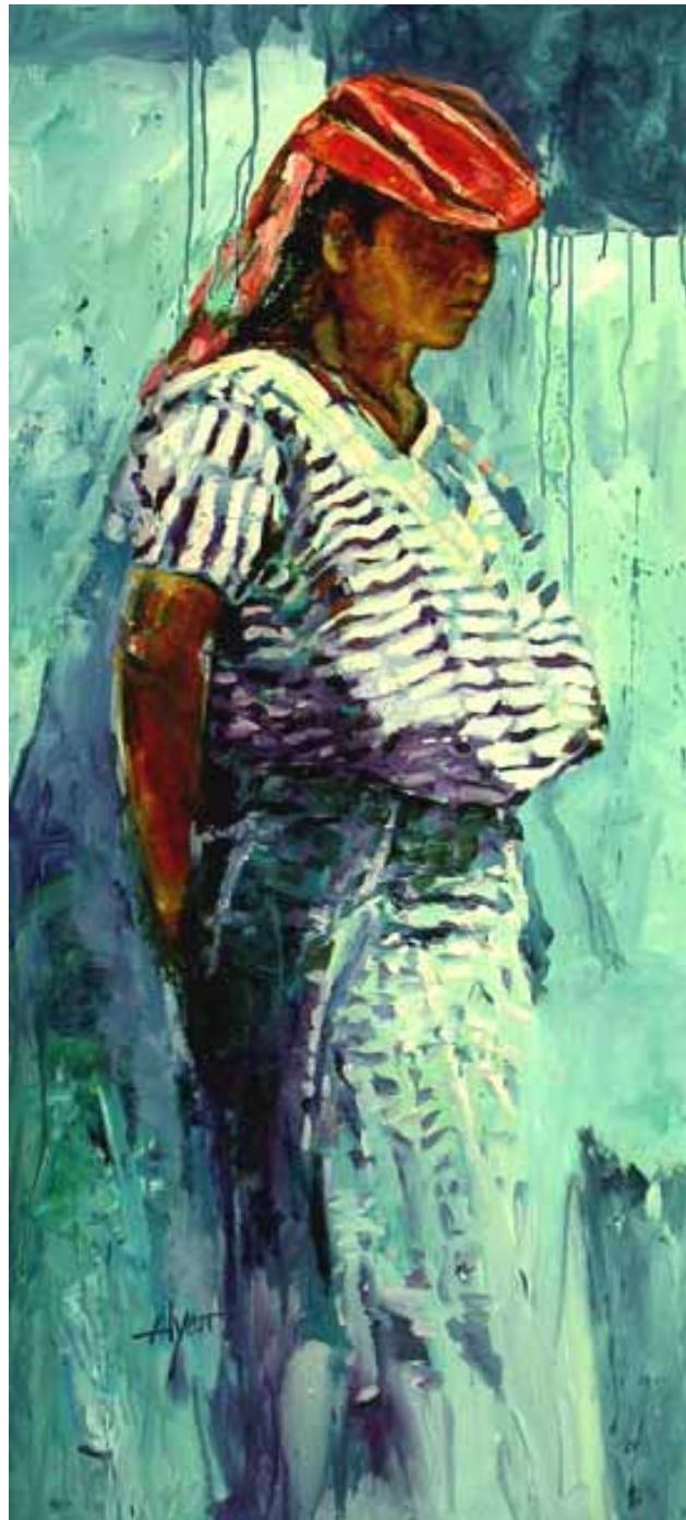
Santiago Stripes , Oil over acrylic, 60"x27." Below, Santiago Six , Oil, 14"x21.5." For details, click on the pictures.