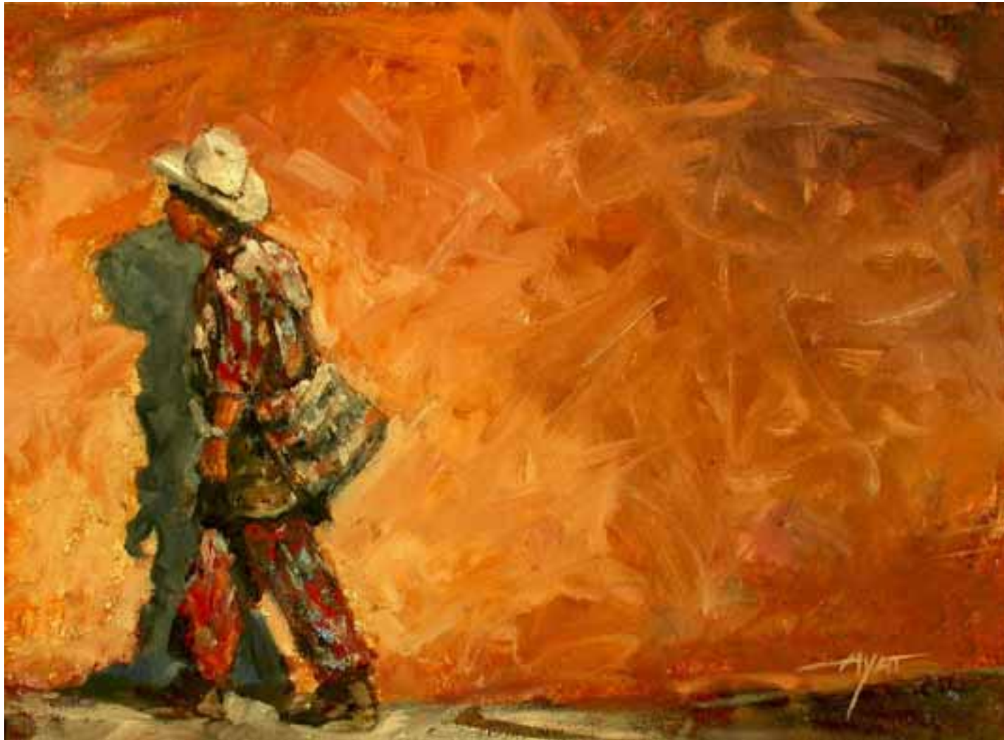
Solola Shadow , Oil on Canvas, 16"x12." For details, and a larger view, click on the picture.

Band of Brothers, an Image from a Men's Retreat