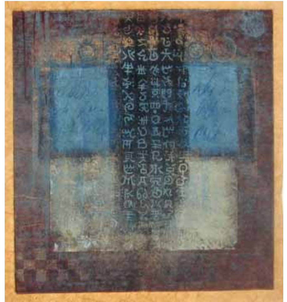
Left, Continuing the Quest , Monotype, 16"x12.5."