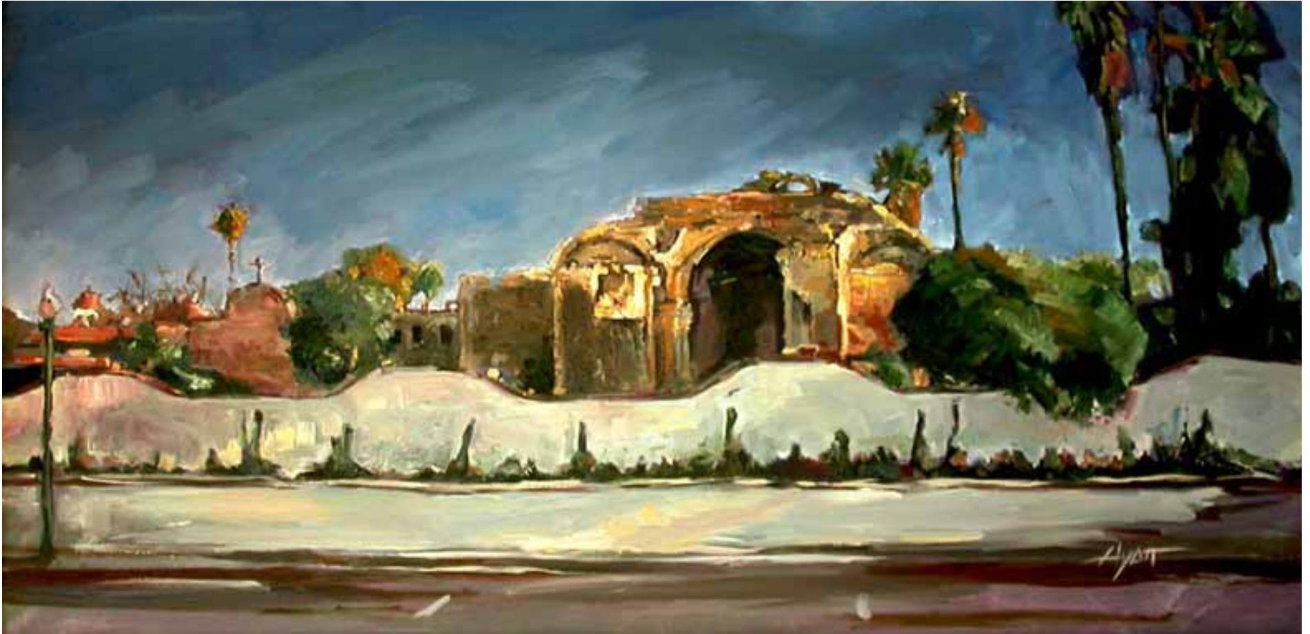
Mission Morning, Oil on Canvas, 24"x48"

The summer season has called for a number of works of local surroundings, including the historic mission at San Juan Capistrano. Here's a building built in 1776, when California was part of Mexico, being settled by Spanish missionaries. The main church, above, was severely damaged within years of its building, but still stands as the "jewel" of the California mission system.