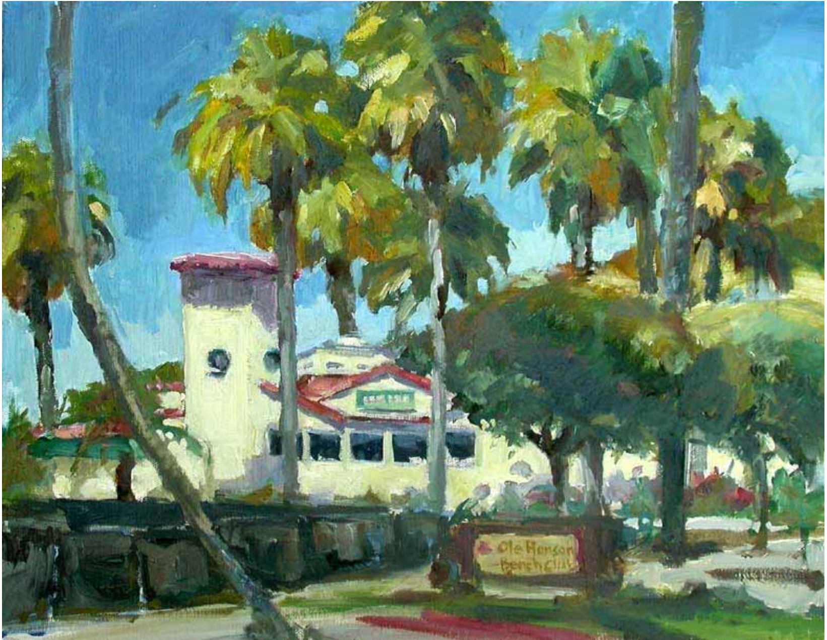
S.C. Ole Hansen Beach Sign, Oil on Canvas, 14"x18"

Each of these were painted as part of the annual San Clemente Plein Air competition, a one-week affair involving about a hundred artists painting live, on location. I was glad for the "honorable mention" on one (the one I liked second best.).