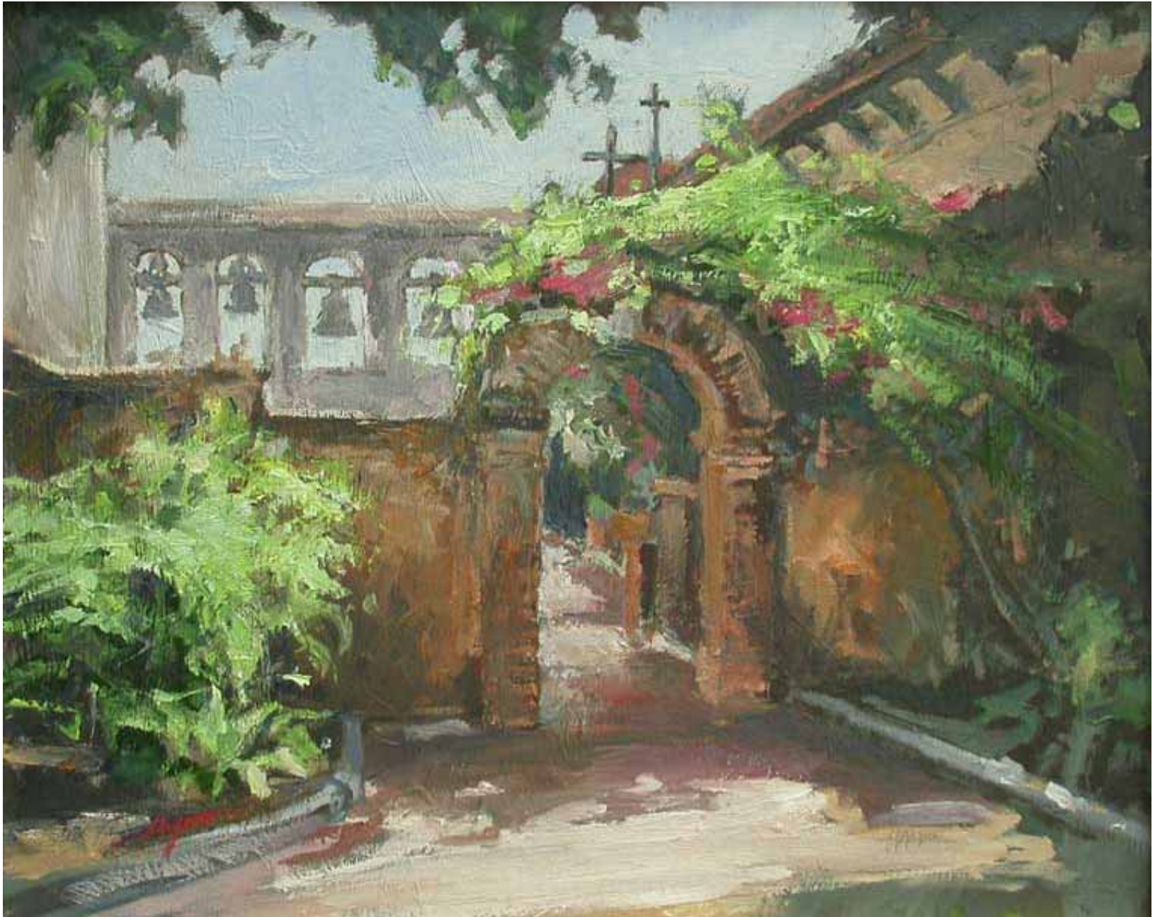
Sacred Garden, Oil on Canvas, 16"x20"