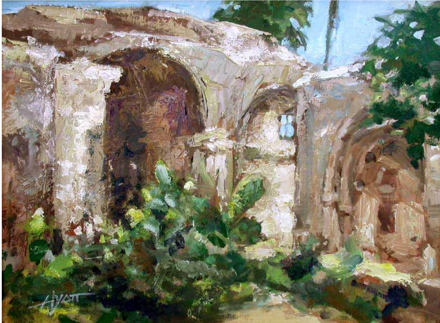
Old Stone Church, Oil on Canvas, 12"x16"

Here's the same church, or ruins of a church, this one painted en plein air in the middle of a bright day. That's unlike the considerable larger piece above, viewed from across the street, outside the mission grounds, from an early morning photograph. One more, from the rear side, follows below.