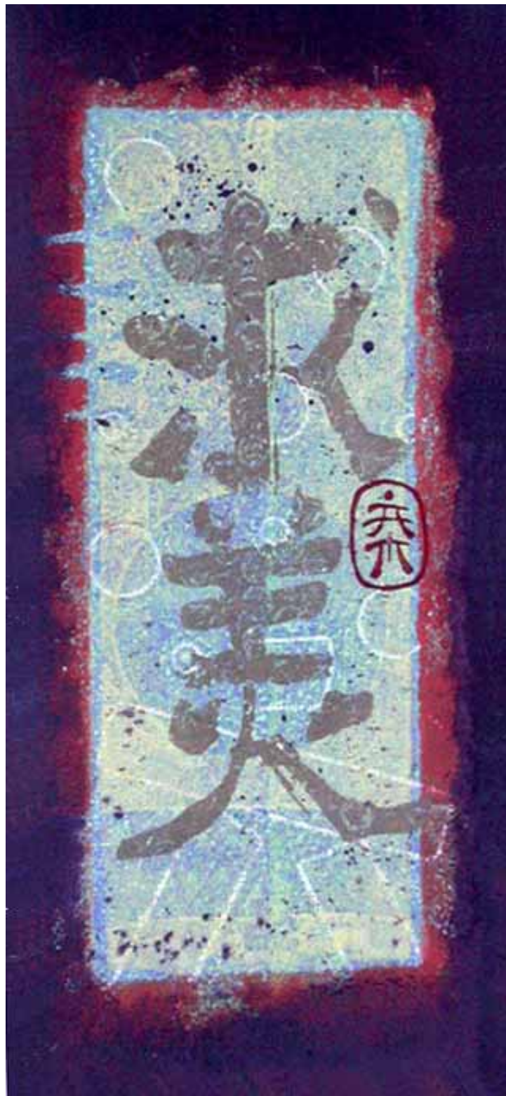
The Quest, Monotype, 13"x6"

This month Anne shows another approach to monotypes. These always start with playful experimentation, full of potential. Ink is layered over ink and run through the hand press, establishing textures and colors. It's all artistic risk. In the three monotypes (meaning, "one of a kind") the kanji symbol is used, large and central. It means "quest for beauty." Here it suggests the struggle to gain balance of inner and outer beauty. Continuing the Asian motif, she printed her "chop," the small symbol using her initials. Unfortunately, much of the color and complexity is lost in the transfer from monotype to photography, to scan, to computer, ours to yours. They really have to be viewed in person.