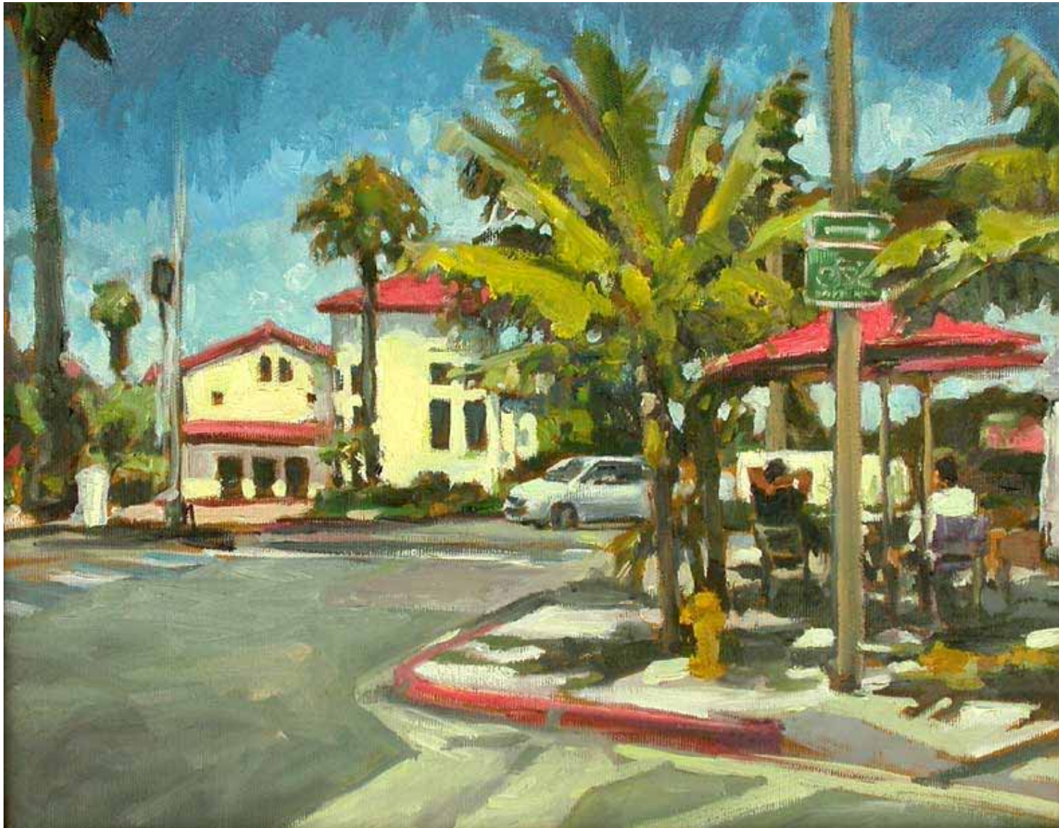
S.C. Railroad Station, Oil on Canvas, 11"x14"

In the spirit of capturing local culture, here is another, more contemporary view, but the architecture is still of a period past—though kept alive in San Clemente. That's the railroad station with Kalani's Coffee indicated at right.