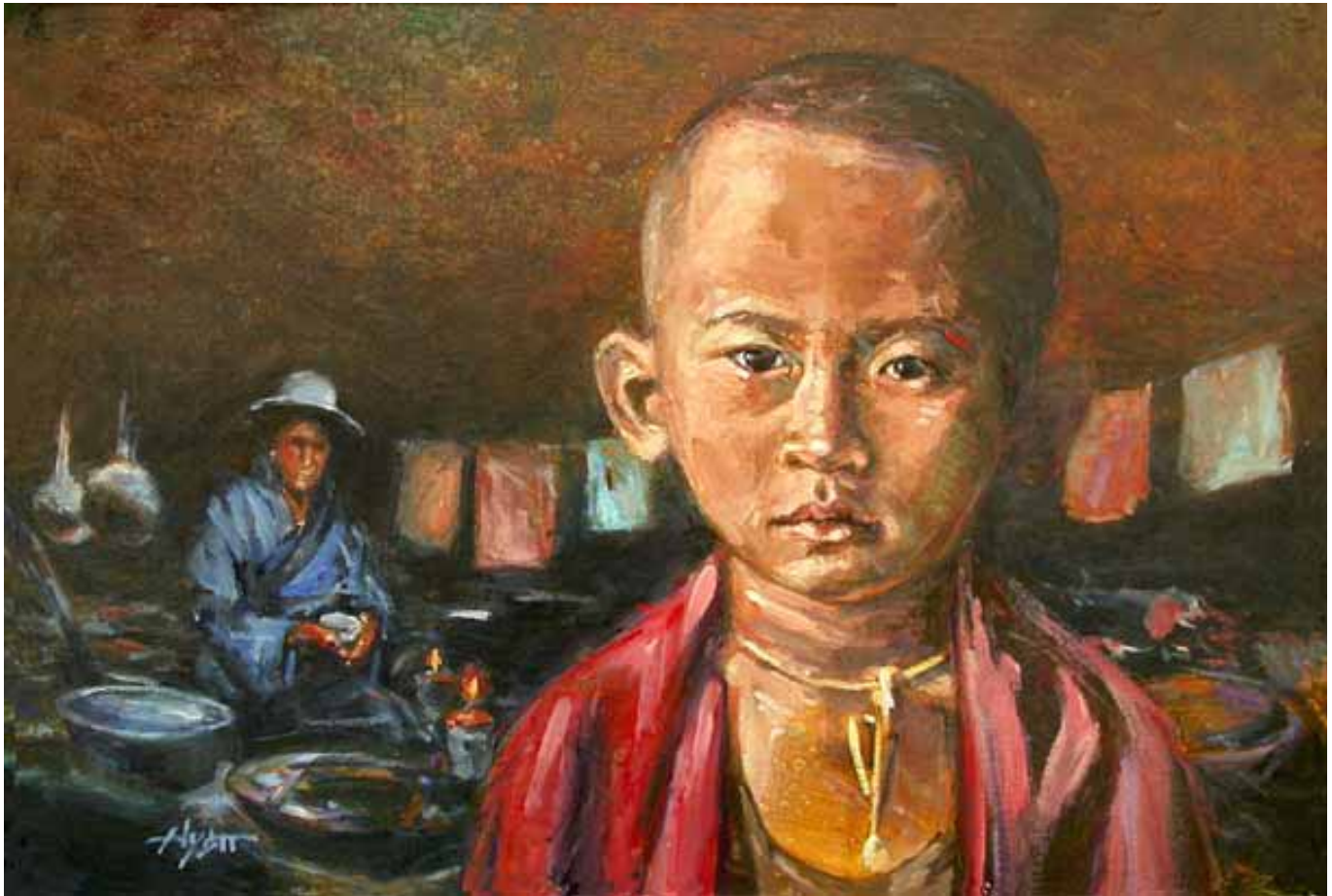
Child Monk and Mother, Tibet, oil over acrylic, 20" x 30"

Here's one painting for a particular purpose but didn't accomplish its aims. That is, unless there really is another purpose yet to be seen. The occasion was the jurying for the Laguna Festival of Arts, a locally prestigious summer-long show on the grounds at the Pageant of the Masters. I'd applied both the last two summers without success. Each time about 135 artists competed for about 35 openings. I'd come in somewhere in the middle of the rejects. This time I tried a new style (how things are judged is a mystery) and, on submitting it, embraced a fairly fatalistic perspective (fitting for the subject maybe). Once again I came in somewhere in the middle of the rejects. So it goes. It was a week's effort. Meantime, those below were painted in terms of minutes, yet brought joy to many and hang in public places. Go figure.