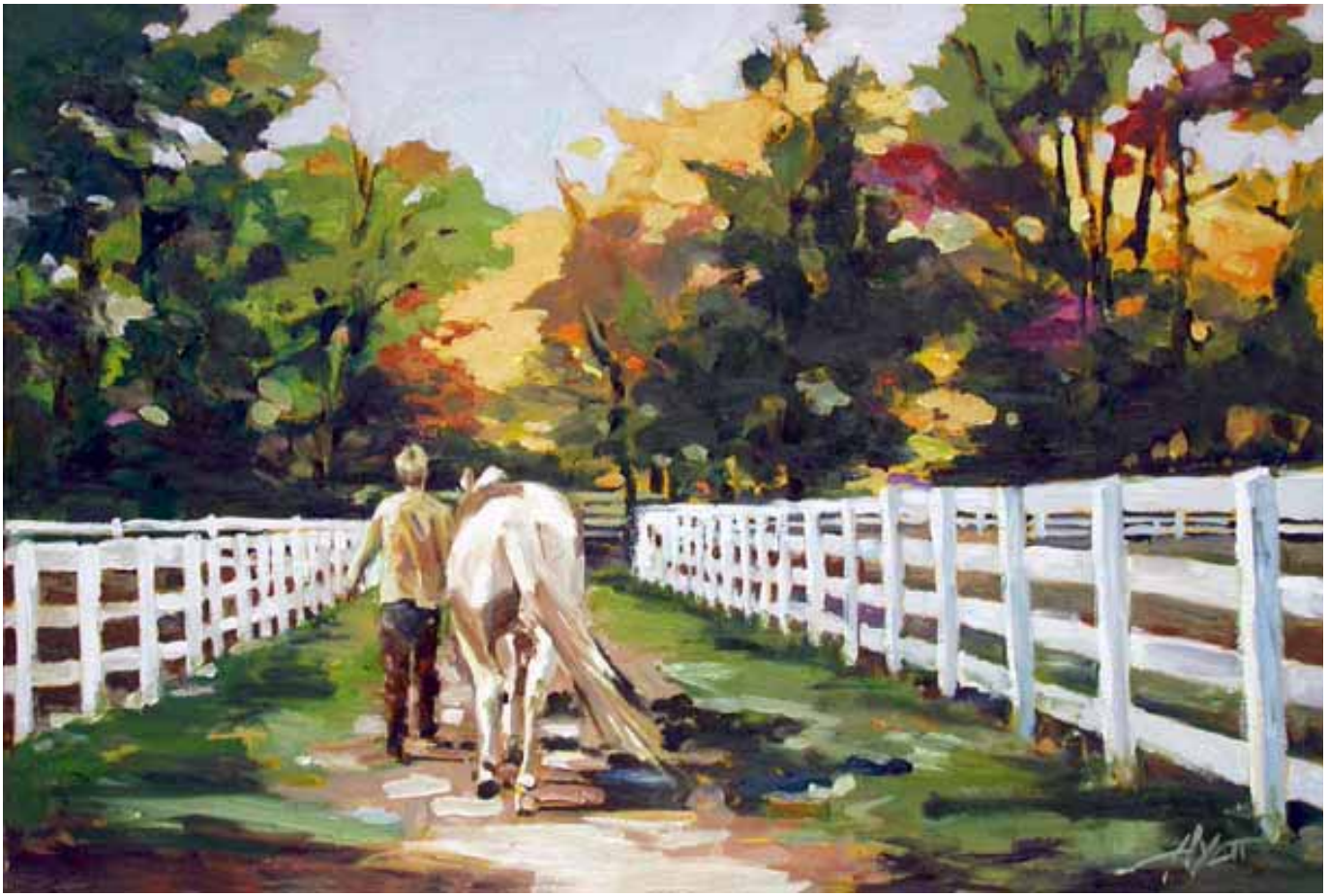
Cindy's Son, oil, 24" x 36"