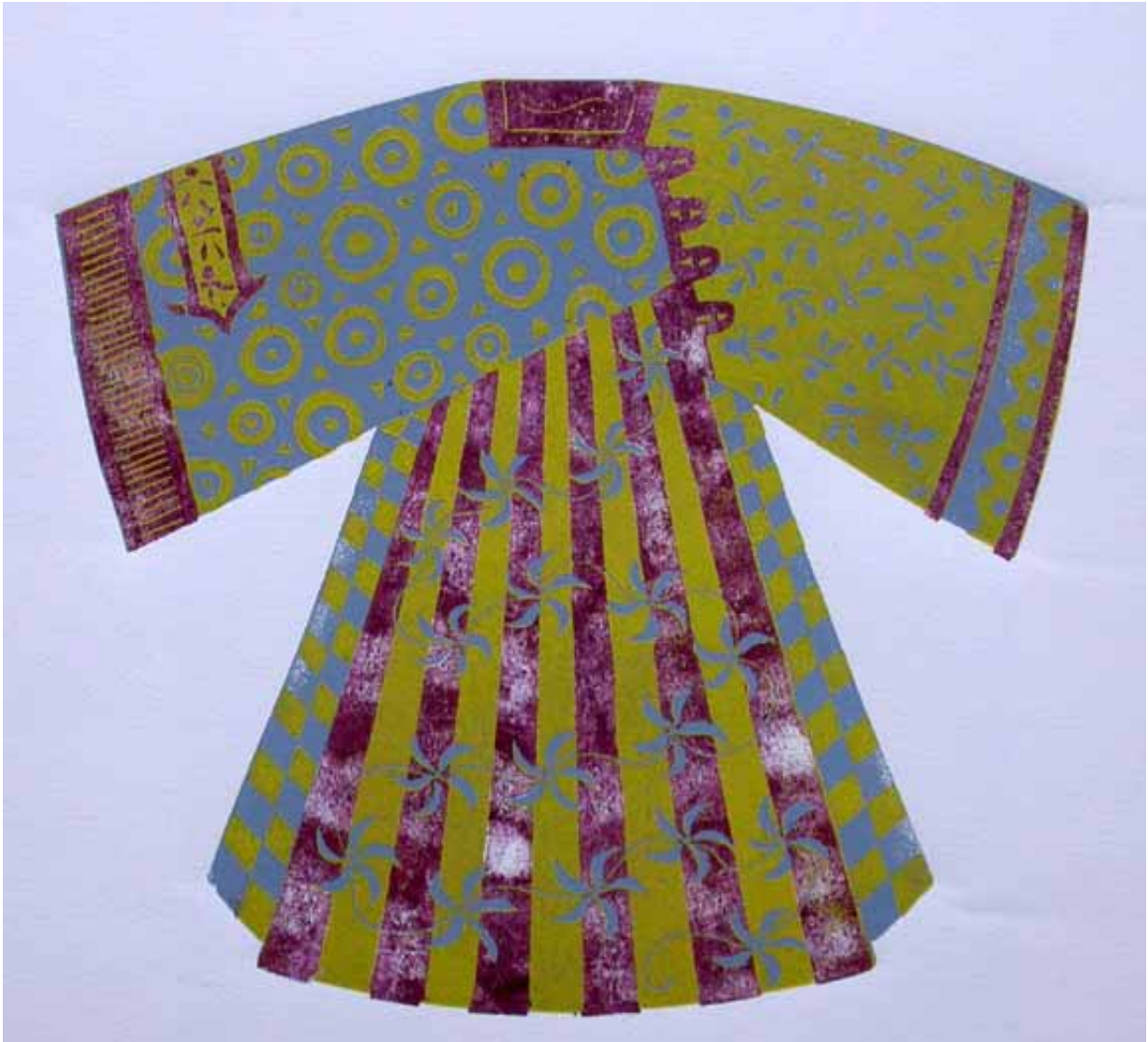
Paper Mono, Reductive Linocut, 10" x 9" image See these and more at www.annemooreprints.com