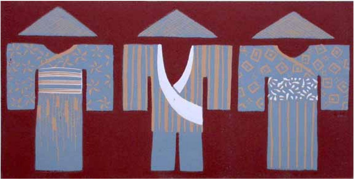
Three Monos, Reductive Linocut, 6" x 11.75"